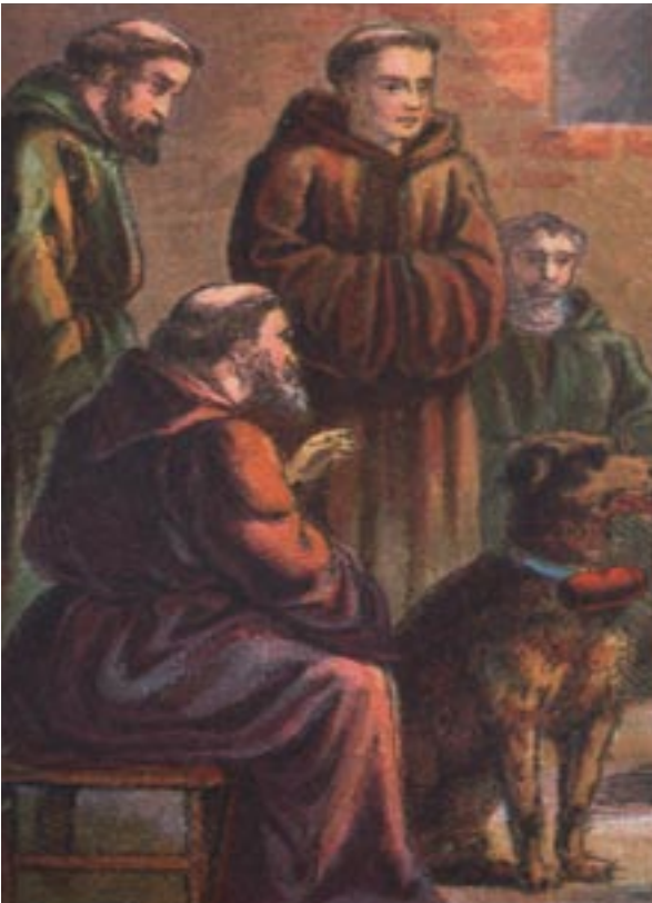
From the story Hector the Dog , picture 13.