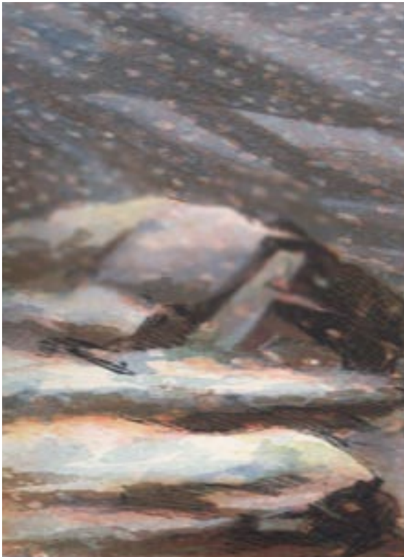
From the story Hector the Dog , picture 6.