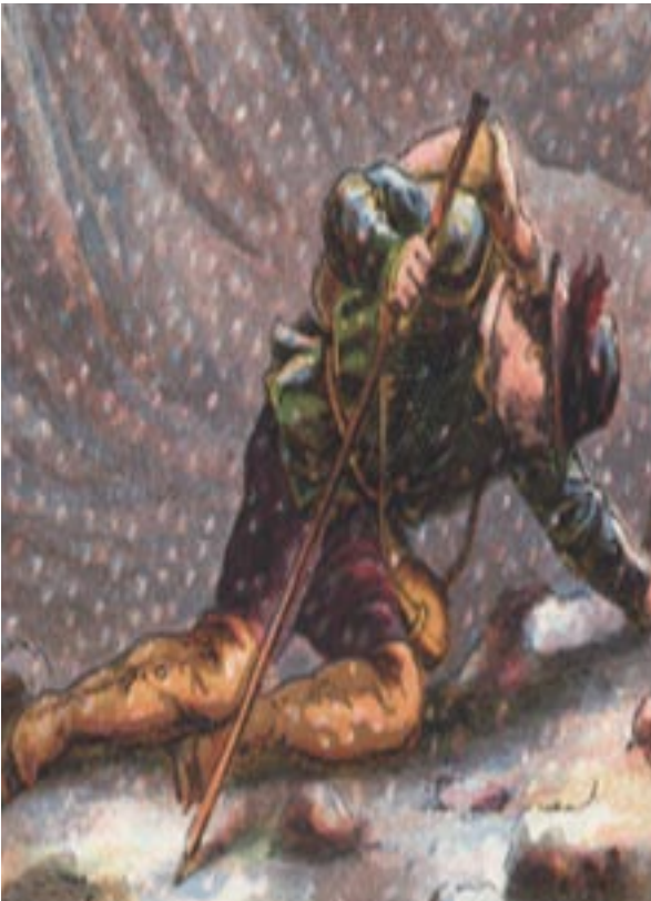
From the story Hector the Dog , picture 10.

unconscious : temporarily not aware of thought or mind