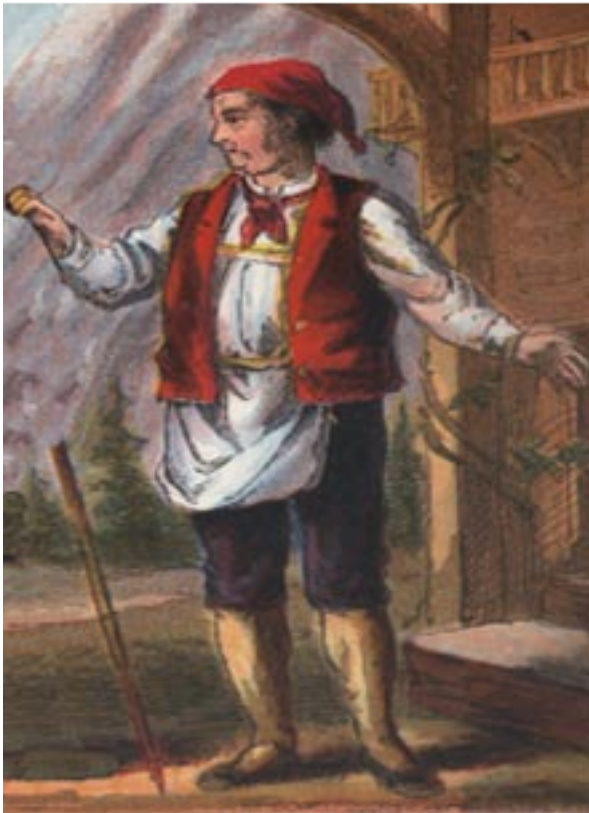
From the story Hector the Dog , picture 2.