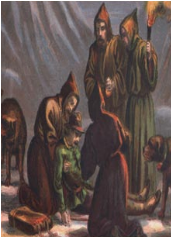
From the story Hector the Dog , picture 22.