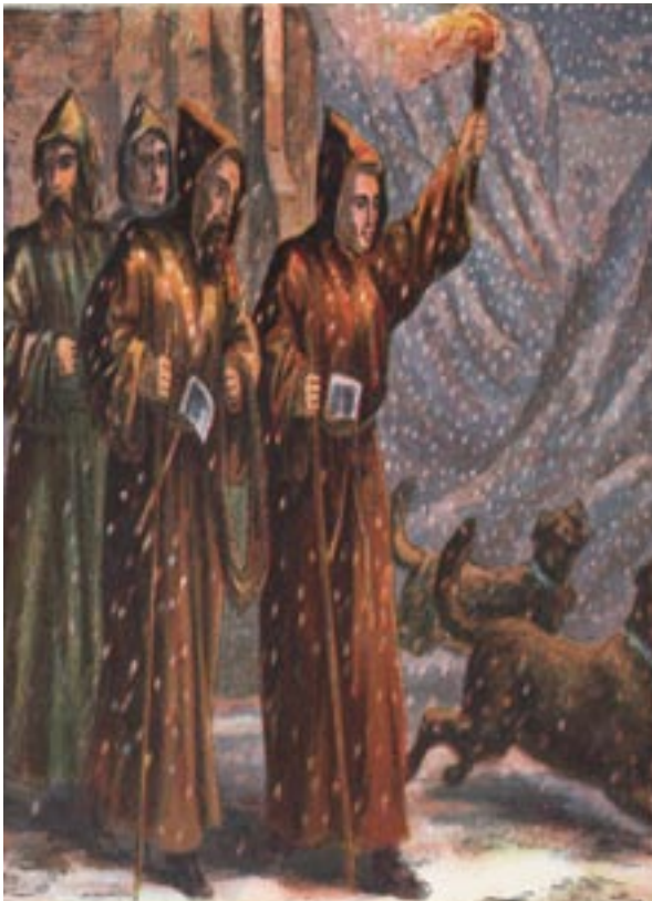
From the story Hector the Dog , picture 15.