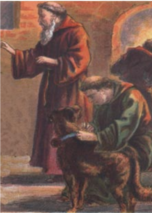
From the story Hector the Dog , picture 12.

monastery : a place where a group of religious people, usually monks, live in seclusion