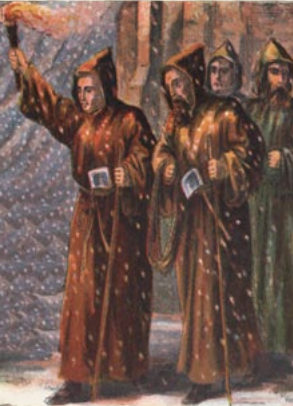
From the story Hector the Dog , picture 16.